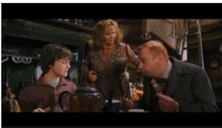
Is the father really upset about the boys flying the car?