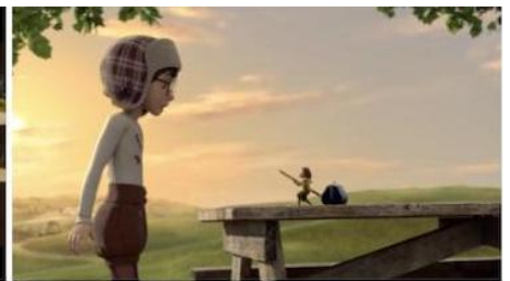
When the little person picked up the pencil, what could they have been thinking?