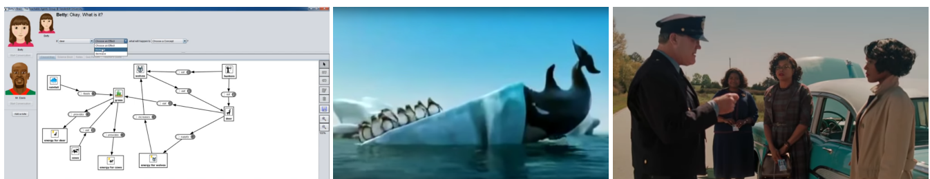
Figure 1: Screenshots of activities in our usability study. Left: A one-hour module on forest ecosystems from the Betty's Brain science education technology (Leelawong & Biswas, 2008). Center and right: TV/movie clips from our social-reasoning QA activity, including animated (e.g., Cooperation short film) and live-action (e.g., Hidden Figures ) clips; Table 2 lists all clips.

Here, we study usability and engagement as part of a formative, user-centered design process in a larger project that aims to translate the Betty's Brain science education system (Leelawong & Biswas, 2008), designed and used to date for typically developing middle school students in general classroom environments, into a new intervention for teaching the-